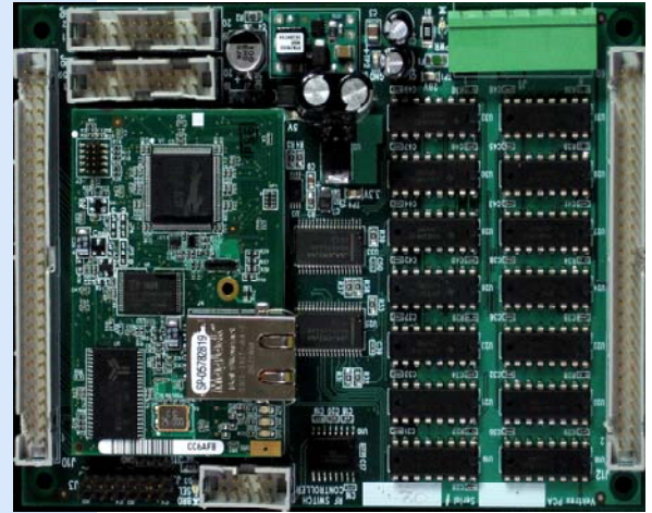
VISC Supporting 112 Ports

Copyright 2007, Vektrex, Version 1.4 10/26/2007