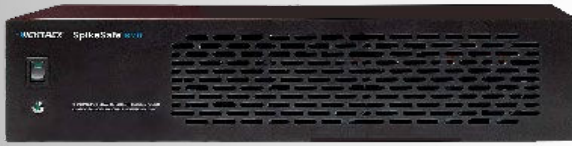
SpikeSafe SMU: Precision pulsed/DC current source with low noise digitizer, optimized for optoelectronic testing