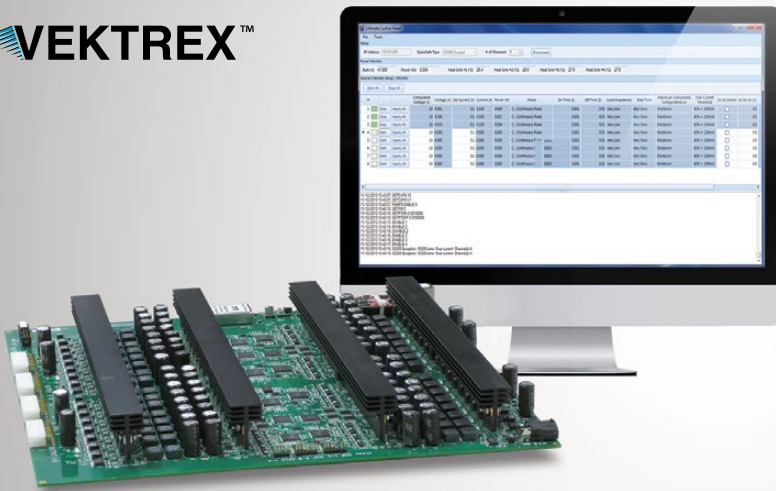
32 Channel module for use in Vektrex driver systems or used as a benchtop system. Comes with easy-to-use Control Panel software.