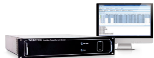
The SpikeSafe 400 is easy to use with included Control Panel software