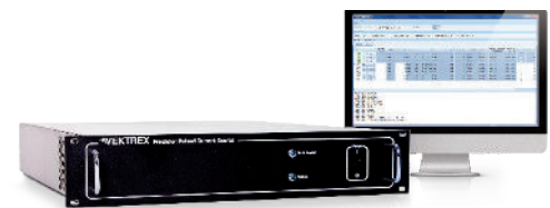
The SpikeSafe 400 is easy to use with included Control Panel software