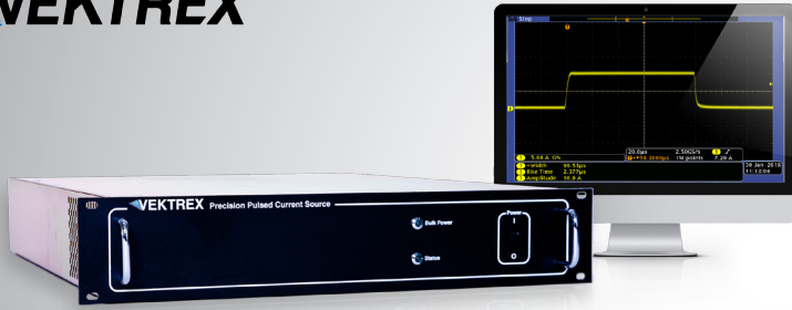
8 Channel module that can be rack-mounted, or used as a bench-top system *shown with the included software - Control Panel