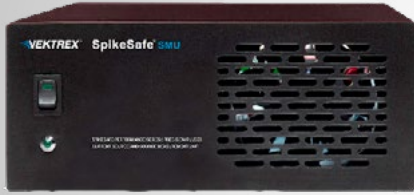
SpikeSafe SMU: Precision pulses with low noise digitizer simplify generation of IV curves.